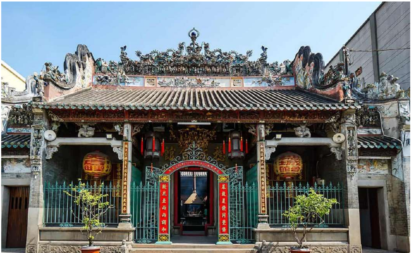
Thien Hau Pagoda

08.00 a.m.: Transfer to Ho Chi Minh City (formerly Saigon) by car on an approximate 45 minute drive to the centre of this bustling city. Today sightseeing includes: